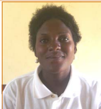
Safe in God's hands!