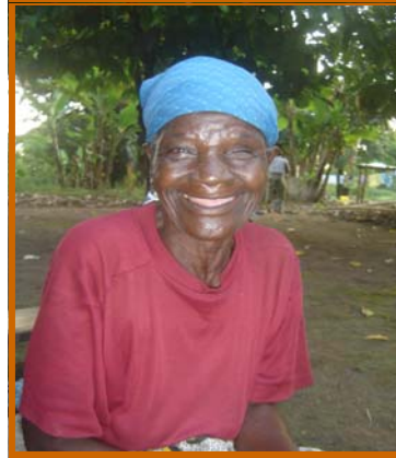
What a smile.. 'Cos we fixed her roof!