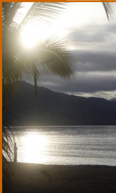
SUNRISE OVER LAKE NYASA, WITH THE LIVING-STONE MOUNTAINS IN THE BACKGROUND